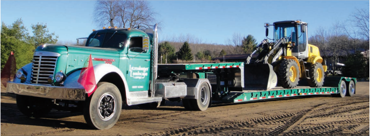
XL 70 Mechanical Full-width Gooseneck