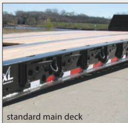
standard main deck

Manual ride height control and double donuts allow the main deck height to vary 1½" in the wheel area and 1½" at the neck to suit the drivers' needs over varying terrains. The trailer is designed for hauling taller equipment, with 6" ground clearance and 18" loaded deck height.